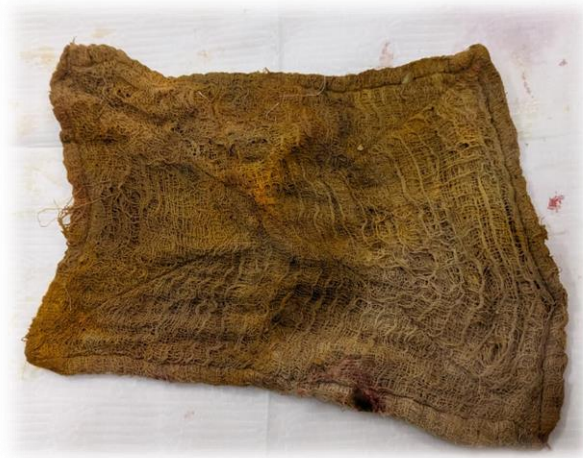
Figure 3: Surgical mop after removed from duodenum

measuring about 8.2 x 6.2 cm in right hypochondrium suggestive of GIT mass.