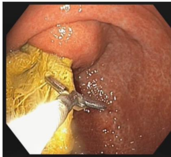
Figure 2: Endoscopic removal of surgical mop

She also complained of occasional feverishness for last one month. She was mildly anemic and dehydrated. All other vital parameters