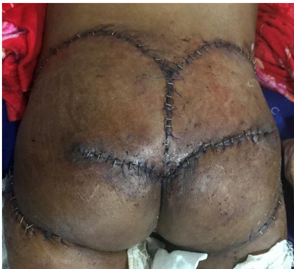
Fig. 3. Preoperative appearance of a sizeable sacral sore. ( above ) The appearance of the reconstructed gluteal region per operative pictures. ( below ) Reconstructed by Bilateral V-Y Rotation Advancement flap.

As our experience and other reports demonstrate, various modifications of the