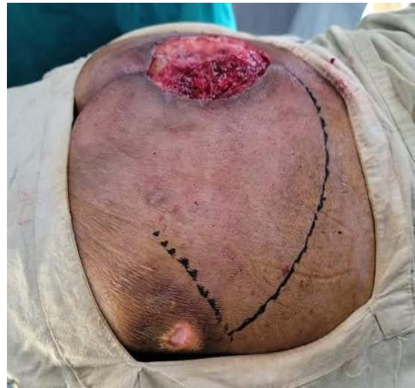
Fig. 2. Preoperative appearance of a sacral pressure sore. A wide surgical wound is created after debridement. ( above ) The appearance of the reconstructed gluteal region per-operative pictures. ( below ). Unilateral Flap coverage. Crescent-shaped, fascio-cutaneous flaps in an interdigitating manner to cover defects that were