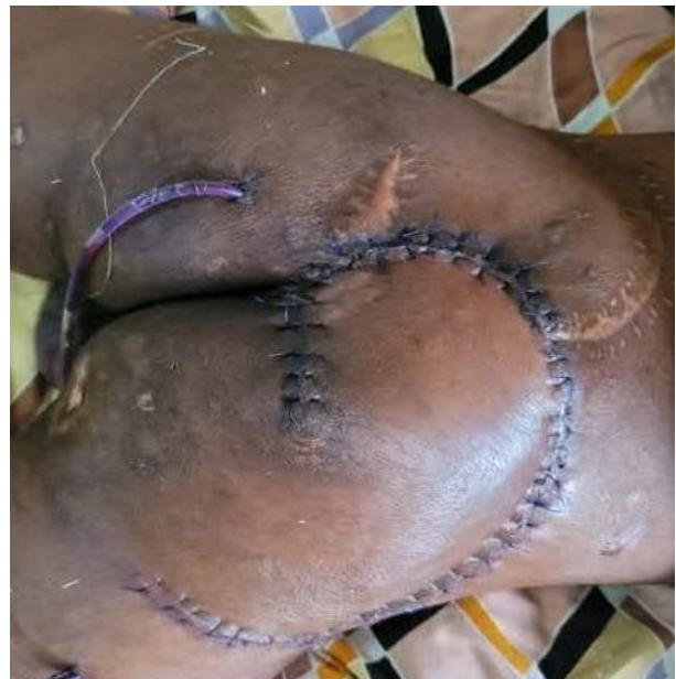
Advancement flap. Later on, covered by Right sided flap. ( Below )

Fig. 4. A recurrent pressure sore ( Above ), Previously covered by a left-sided V-Y Rotation